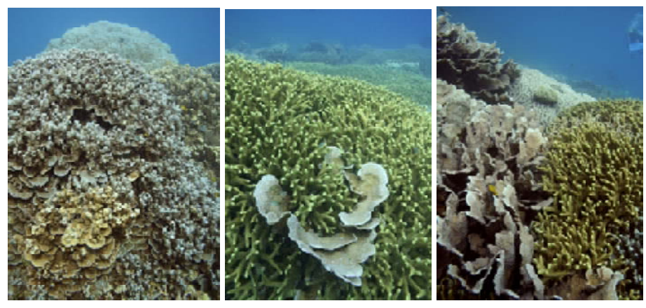
dense scleractinian coral coverage on the reef fringing the east side of Penjalin Besar