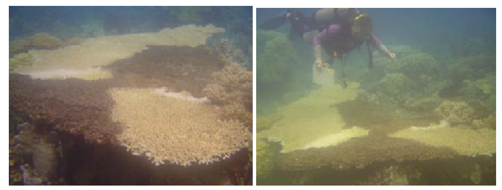
a large table Acropora colony suffering from white band disease in the transect zone