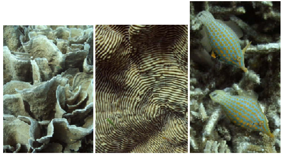
Echinopora lamellosa; Pachyseris speciosa; longnose filefish in the shallows