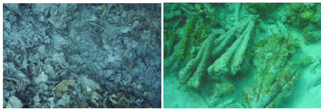
rubble from damaged plate corals; damage from old dynamite blast shattering a colony