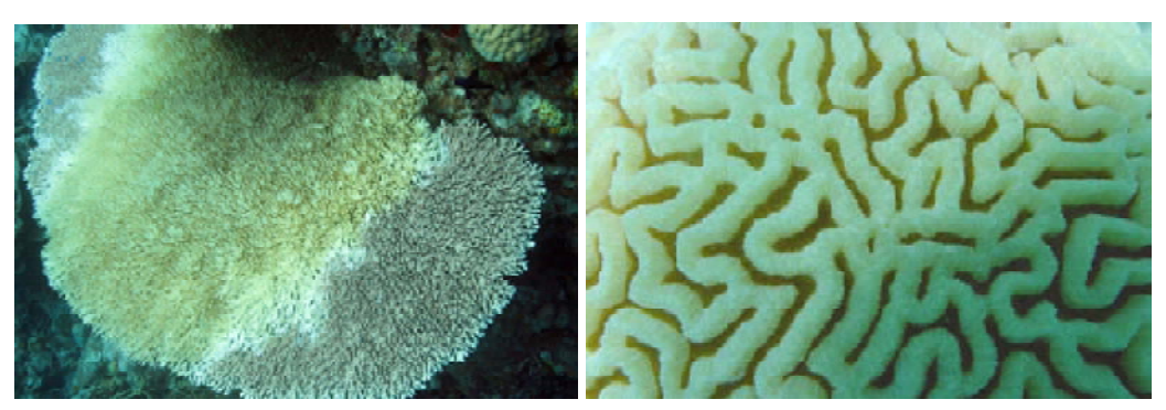
white band disease on a table Acropora colony; healthy scleractinian coral