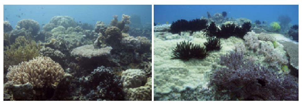
soft corals, feather stars and gorgonian sea fans at approximate depths 10-20 meters