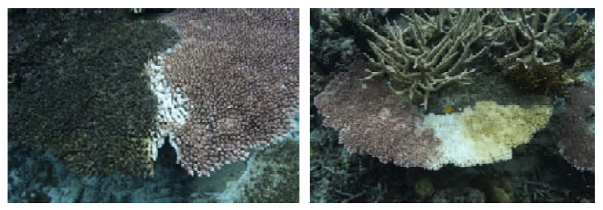
white band disease afflicting many table Acropora colonies on this reef

Health and vitality observations: Although there were several pretty scenes, the overall impression of this reef was that it is flawed. At least one colony in a cluster of about ten would be either diseased, ravaged by a crown of thorns or dead and covered in dark grey filamentous algae. Table Acropora spp. colonies were suffering from a curious condition in which part of the colony was bright white with the tissue removed, resembling extremely recent damage by a crown of thorns, but the rest of the colony was absolutely dead and overgrown with dark filamentous algae. It is possible that this particular algae is rampant and overgrows damaged patches of coral extremely quickly. One table Acropora spp. colony had a narrow white band in which the tissue and cilia were still visible. This band separated healthy coral tissues from dead tissue overgrown with dark grey filamentous algae. Another table Acropora spp. colony had lost its edges which had fallen to the ground in small pieces. The 'new' edge on the colony appeared to be wasting away rather than broken and the fragments on the seafloor were still alive and looked healthy. We sighted five crown of thorns here. A large Astreopora spp. colony had a very large section freshly killed by a crown of thorns. The seastar was anchored just beside the colony. We found a length of fishing line on the reef and a 5cm diameter length of cable.