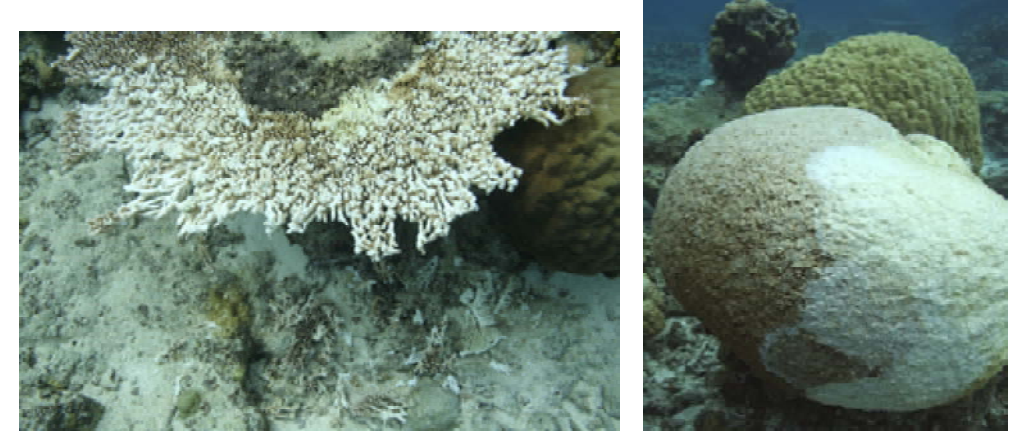
an Acropora colony; a large Astreopora colony with fresh tracks from a feeding crown of thorns seastar