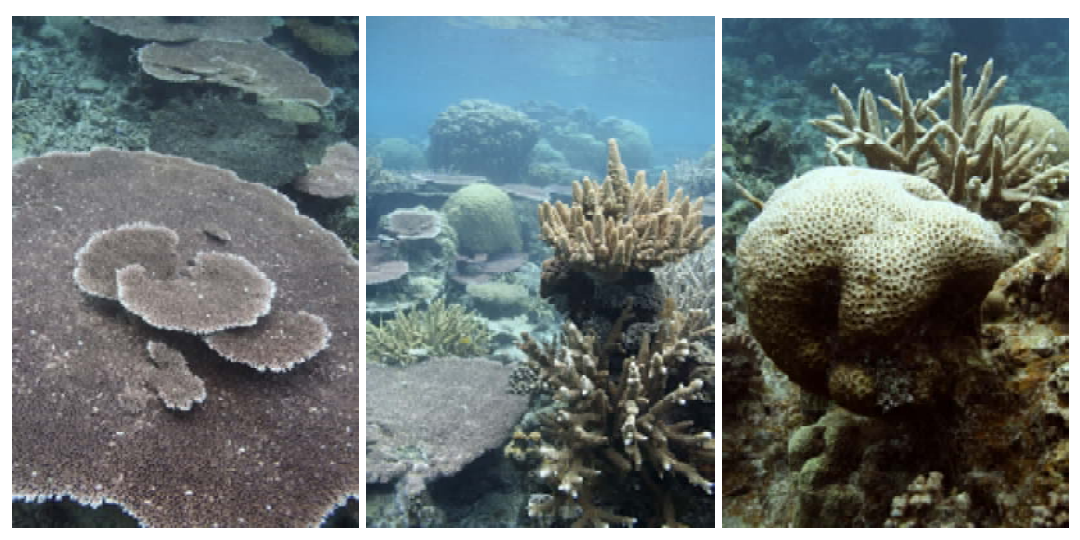
reef scenes on the west side of Penjalin Besar