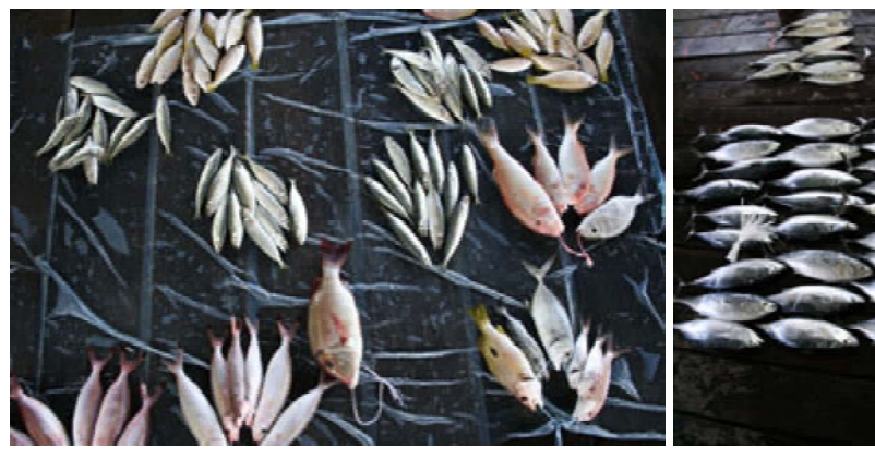
reef fish and tuna at the fish market which starts at 5am