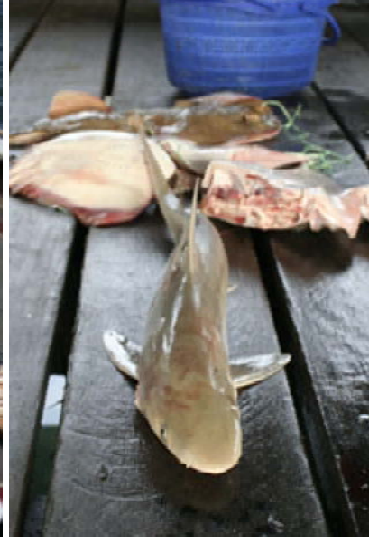
guitar fish, shark fins and a very small juvenile shark