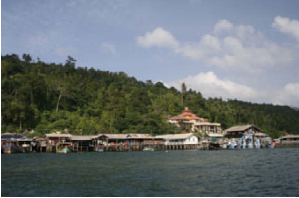
SV Infinity approaches Siantan, passing Terempah before anchoring in Tebu