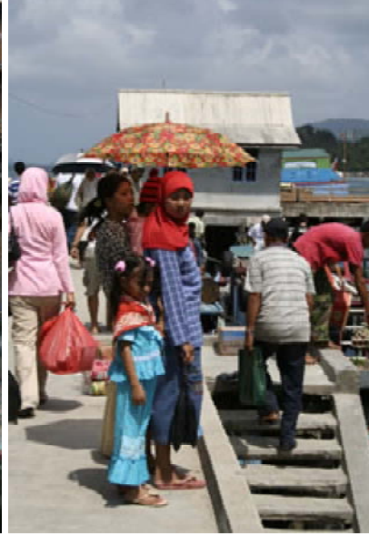
there are no cars, only boats and a couple of motorcycles