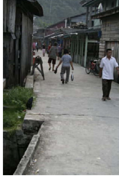
everyone in town comes to buy their catch early in the morning, the market closing for the day around 7am