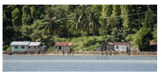
their guest house in Tebu; most houses we saw in the Anambas Islands are built on stilts over the sea