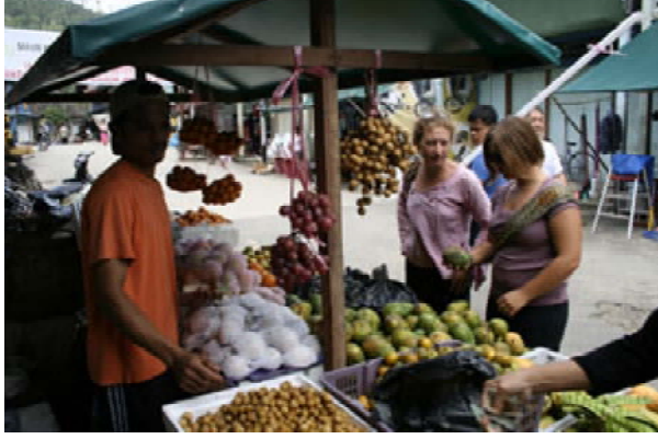
scenes from the fresh food market