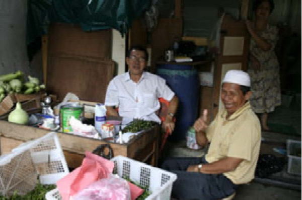
street scenes in Terempah