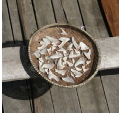
clams cut up; shark fins drying on the roof of a fishing boat