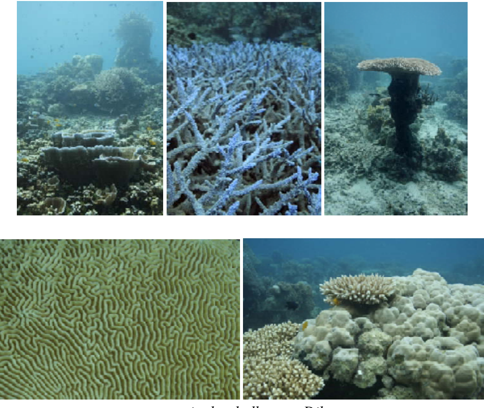
scenes in the shallows at Dikar

Reef health and vitality observations: We sighted just two corals with white band disease and saw no signs of crown of thorns damage. There was an old 5 meter length of fishing net snagged on corals at about 10 meters depth. We passed over one rubble area, about 5 meters wide, which is possibly traces of a previous bomb blast. However, new colonies of Montipora spp. and Acropora spp. are growing in it. Some of the smaller Porites colonies in the shallows were suffering from edge damage, a condition in which filamentous algae traps sediment on a coral's surface, encroaching gradually over live tissue.