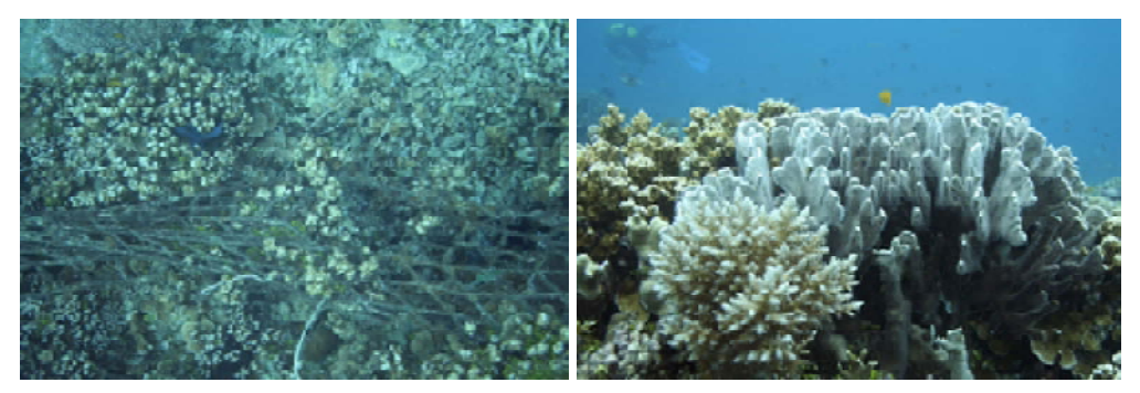
fishing net snagged on the reef; blue coral (Heliopora coerulea)