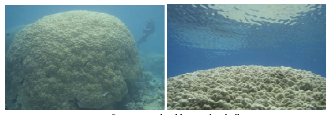
massive Porites spp. boulders in the shallows